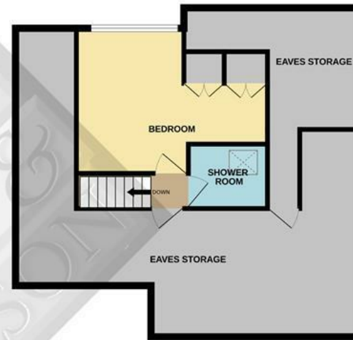
1ST FLOOR 686 sq.ft. (63.8 sq.m.) approx.